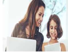
Cat 6A Guide - 30 minutes