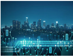
Digital Buildings Done Right - 50 minutes