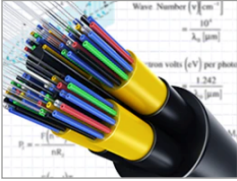
Fiber 101 - 60 minutes

Complete all courses below from October 1 st to 31 st and win 8000 AD points